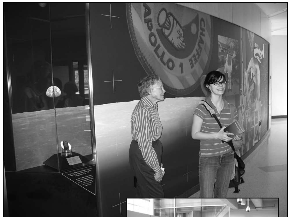
Retirees visited Neil Armstrong Hall of Engineering in April, where they saw (above) an exhibit about astronaut Roger Chaffee, and heard a presentation (right) about the Engineering Projects in Community Service (EPICS) program. The Campus and Community Activities Committee works to schedule interesting and informative tours throughout the year.